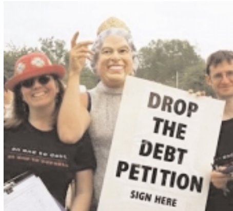
Royal campaigner spotted at Glastonbury

By mid-September 60,000 plus signatures had been collected (over two thirds of