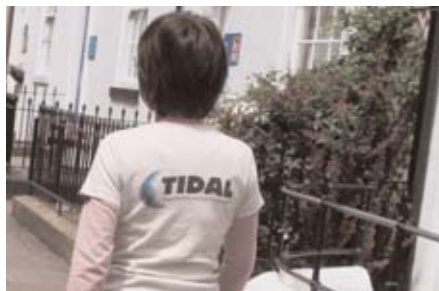
Find out how your TIDAL T-shirt was manufactured.