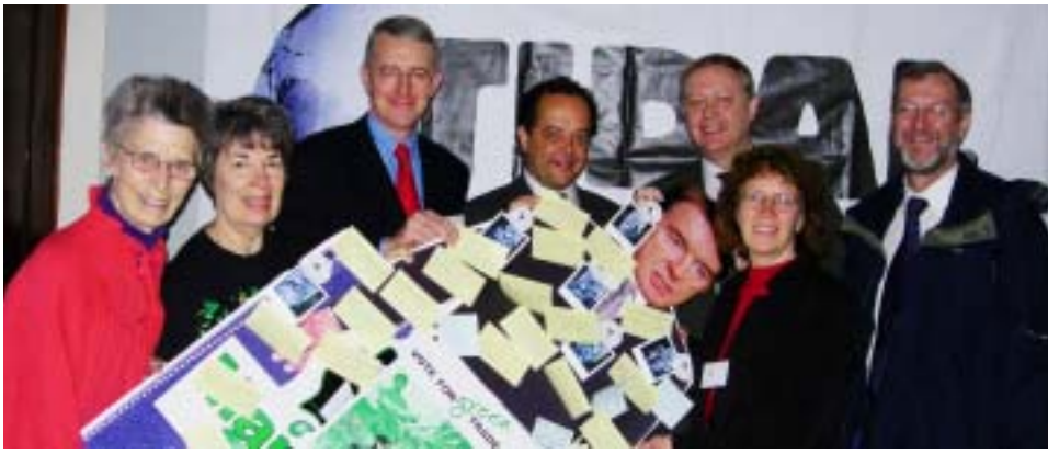
A rather two-dimensional Peter Mandelson gets the Trade Justice message from TIDAL supporters and Leeds MPs.