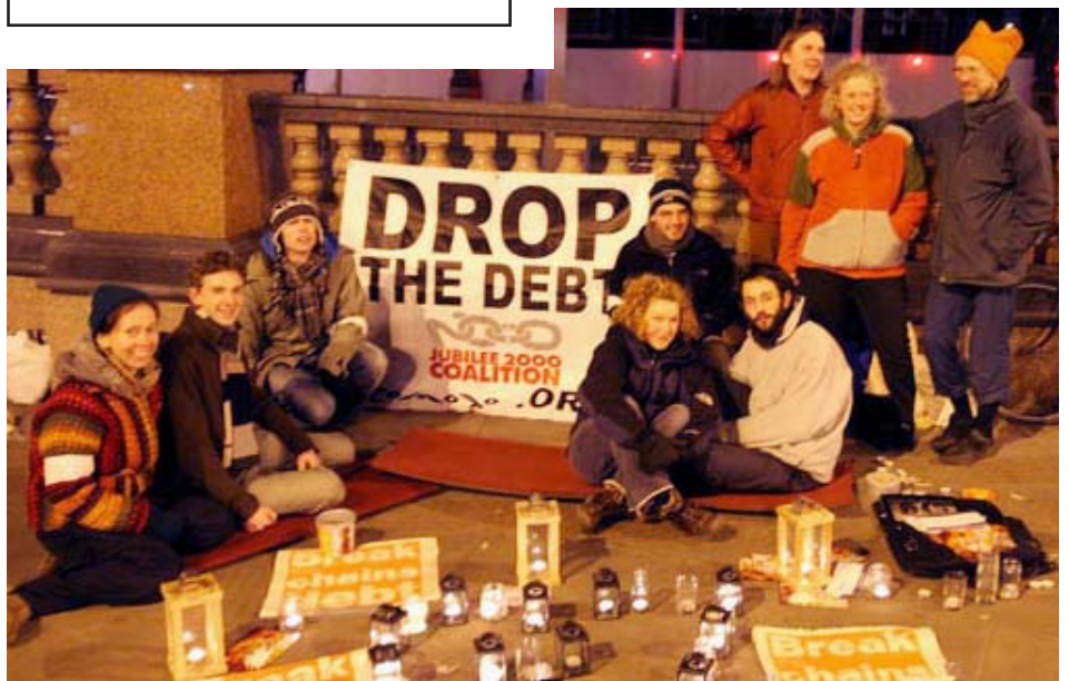
Participants at the 30 hour vigil in City Square on 4/5 Feb.